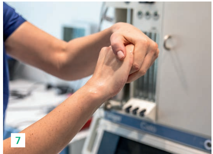
Outside of fingers on opposite palms with crossed fingers.