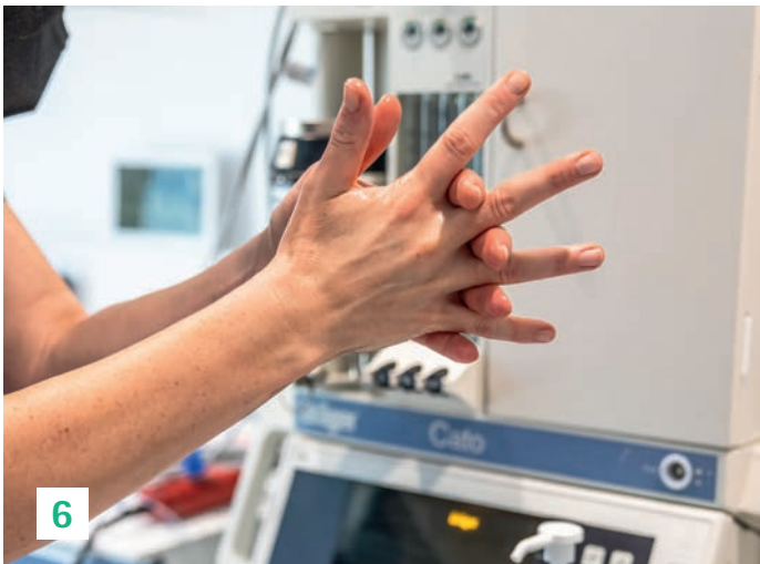
Palm to palm with fingers spread apart.